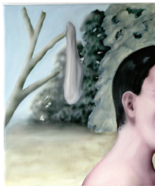
Brieuc Maire Le cri , 2021 Acrylic and oil on canvas 49 x 38 cm