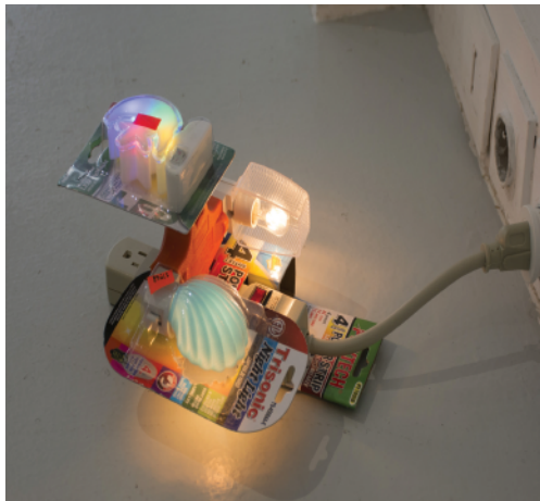
Théophile Brient, Compassion is the pillar of World Peace , 2019 Nightlight approx 20 x 15 x 15 cm

Théophile Brient and Lingjun Yue question the original state of the objects to insert them into a new environment, to the point of distancing them from their own use. As if these everyday objects, gleaned from cheap bazaars or private interiors, had first been used to transmit moral and spiritual values in the home.