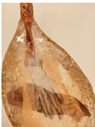
Malù dalla Piccola, Ampolle del senno perduto , 2021 Gauze in resin and copper

The works of Malù Dalla Piccola and Victoire Inchauspé exalt states of transformation by drawing attention to the malleability of structures, to the fluid and adaptable potential of organic supports and metals. Attached to the idea of a life cycle, Piccola's resin and copper tears or Inchauspé's bronze bas-reliefs represent a constellation of crystallized and frozen memories. These installations and sculptures underline the ineluctable human condition, always suspended between the past and the future, between a limited temporality and eternity.