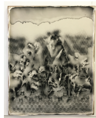
Diego Garcia Lara Phasma 1 , 2021 Black ink, flowers and charcoal 61 x 78 cm

It is at the very heart of the work process of all these artists that we find contemporary concerns such as the recycling of materials and objects, the rereading of historical and cultural heritages or the re-examination of identity constructions.