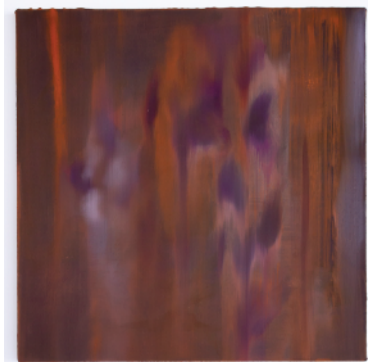
Mia Vallance Burial , 2021 Oil on canvas 40 x 40 cm